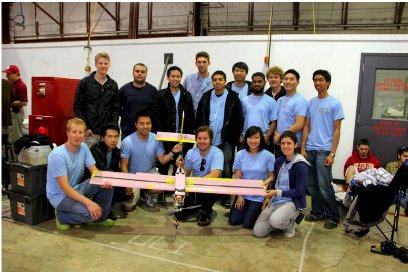
Second Place Winner: University of California at Irvine: Angel of Attack.