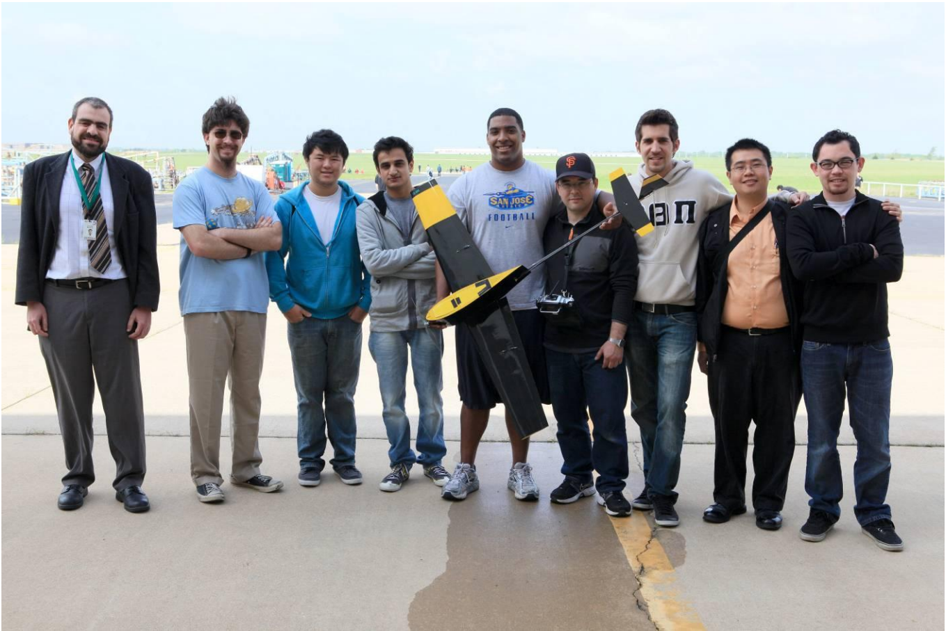
First Place Winner: San Jose State University: Team PhalanX.