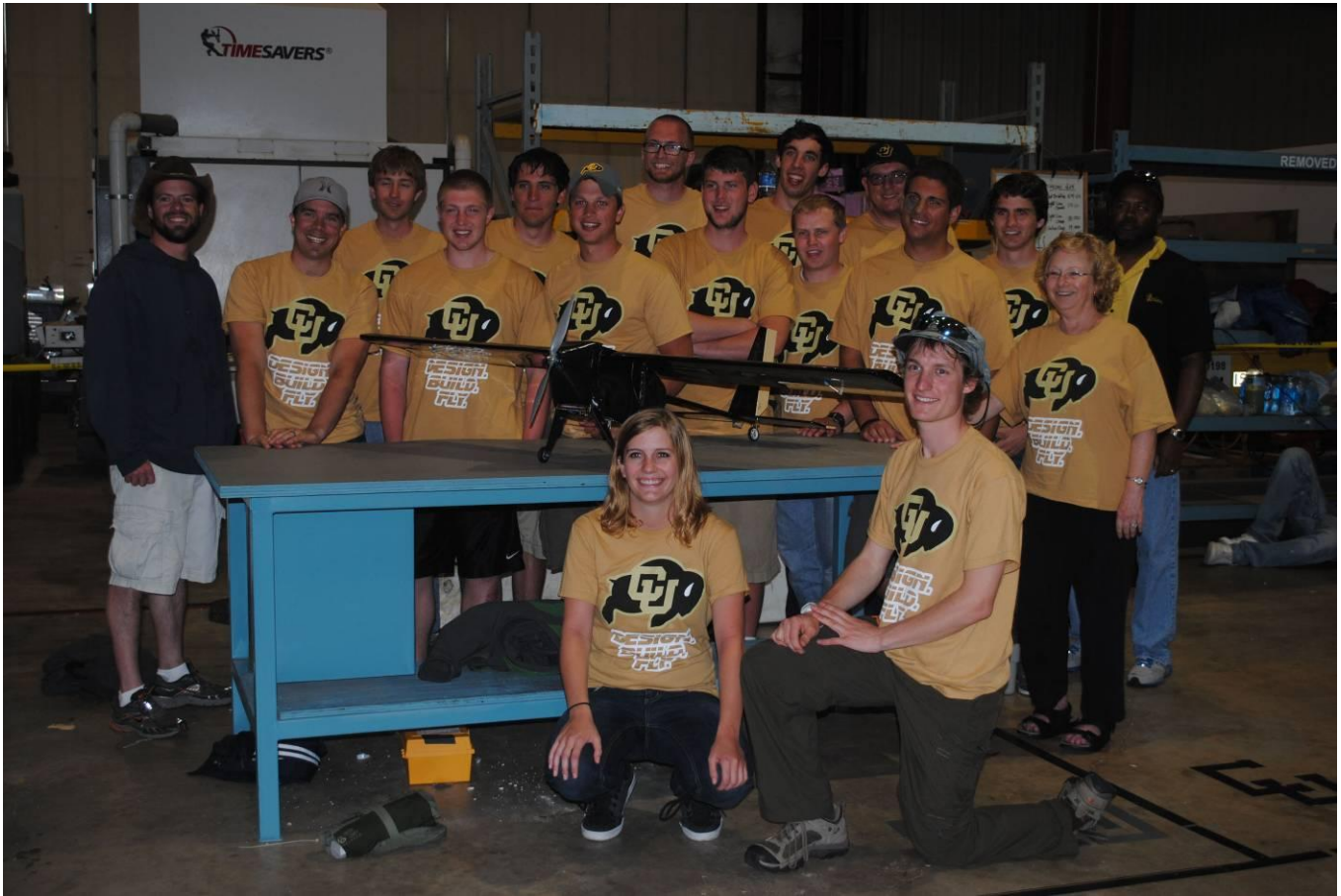
Third Place Winner: University of Colorado: H2Buffalo.