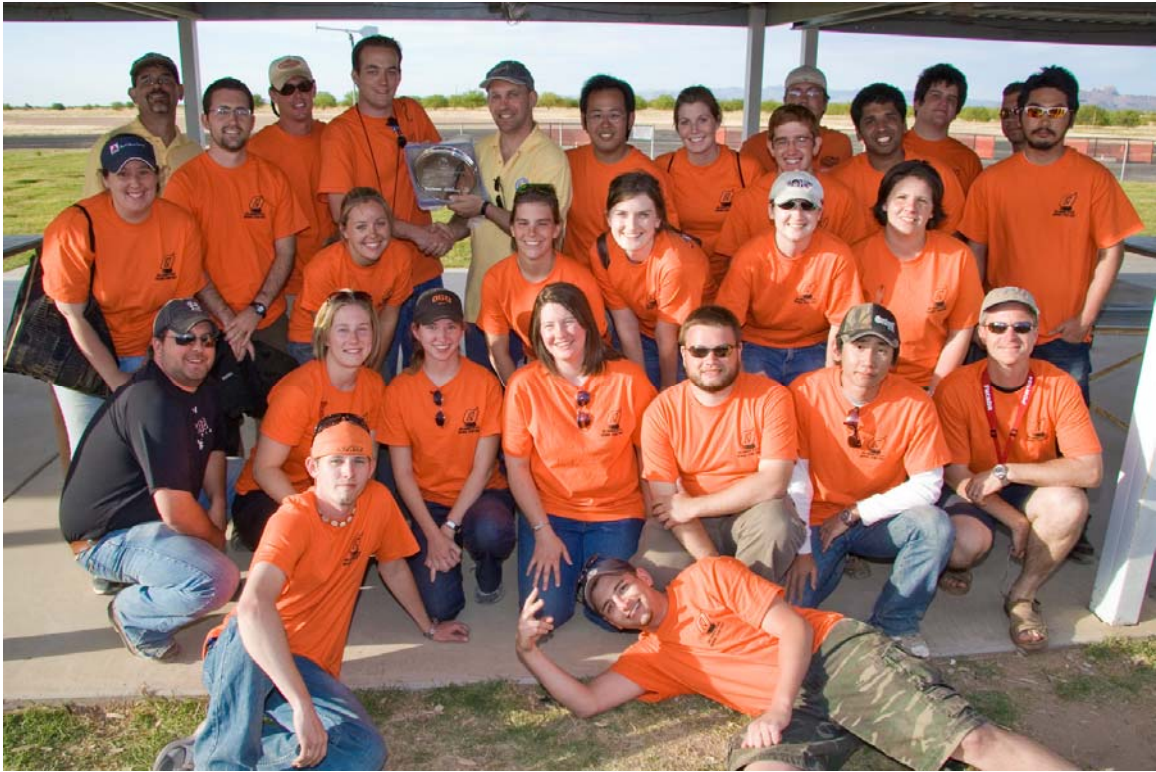
2 nd Place Aircraft