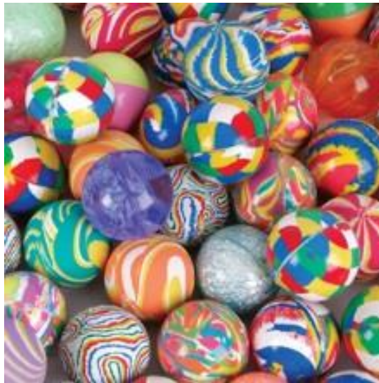
Figure 1. Super Balls (or Bouncy Balls).